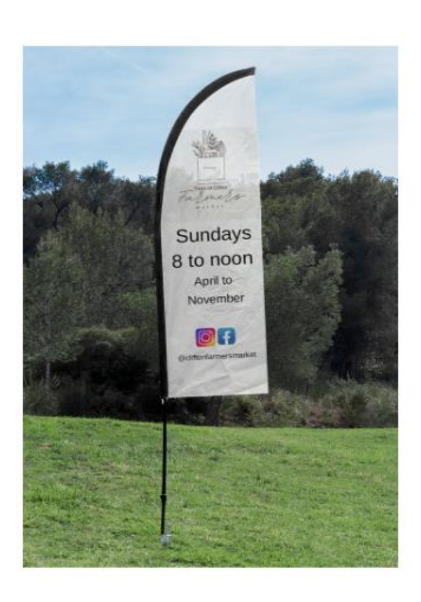
Flag Base to use (fillable with water or sand, weatherproof):